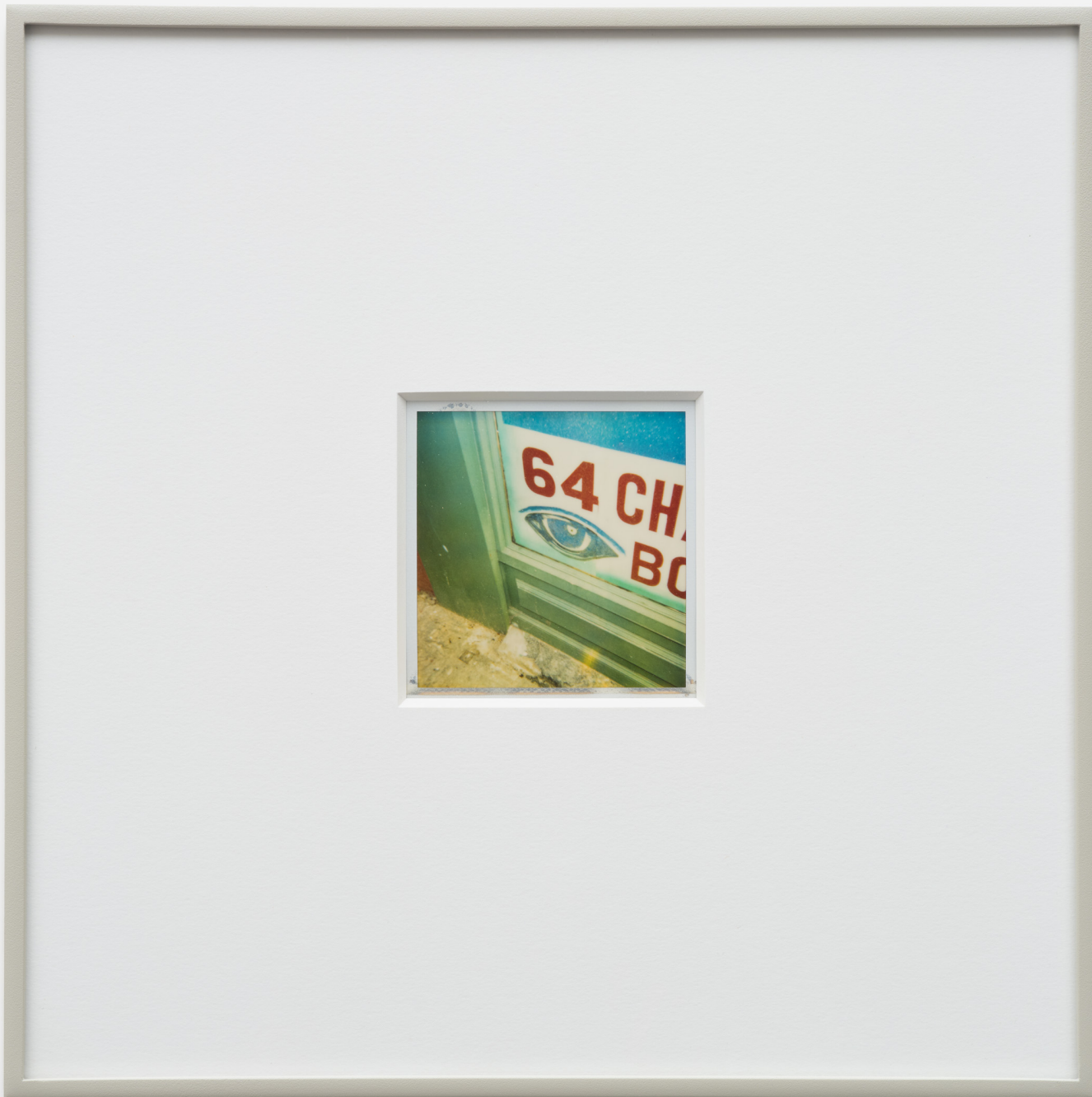
Tom Burr, Untitled (42nd Street Structures) , 1995.

Polaroid photograph. 3 1/8 x 3 1/8 in ; 8 x 8cm (image), 12 x 12 in ; 30.5 x 30.5cm (framed). 4 500$