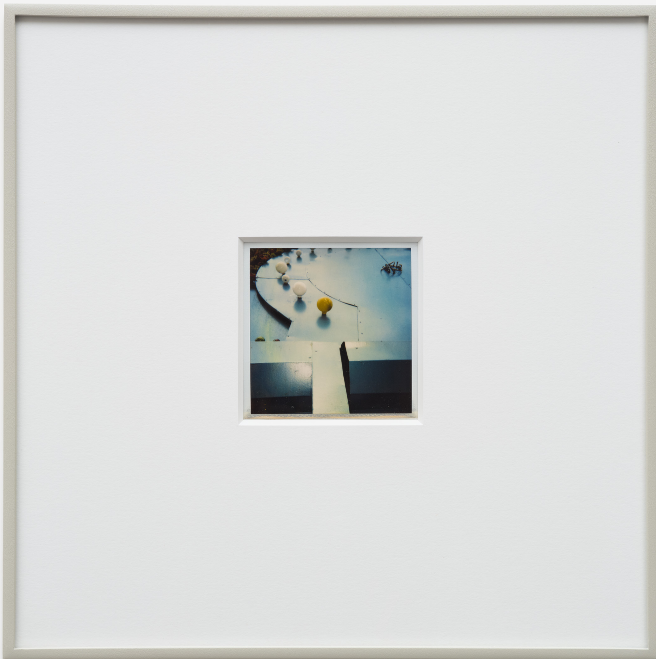
Tom Burr, Untitled (42nd Street Structures) , 1995.

Polaroid photograph. 3 1/8 x 3 1/8 in ; 8 x 8cm (image), 12 x 12 in ; 30.5 x 30.5cm (framed). 4 500$