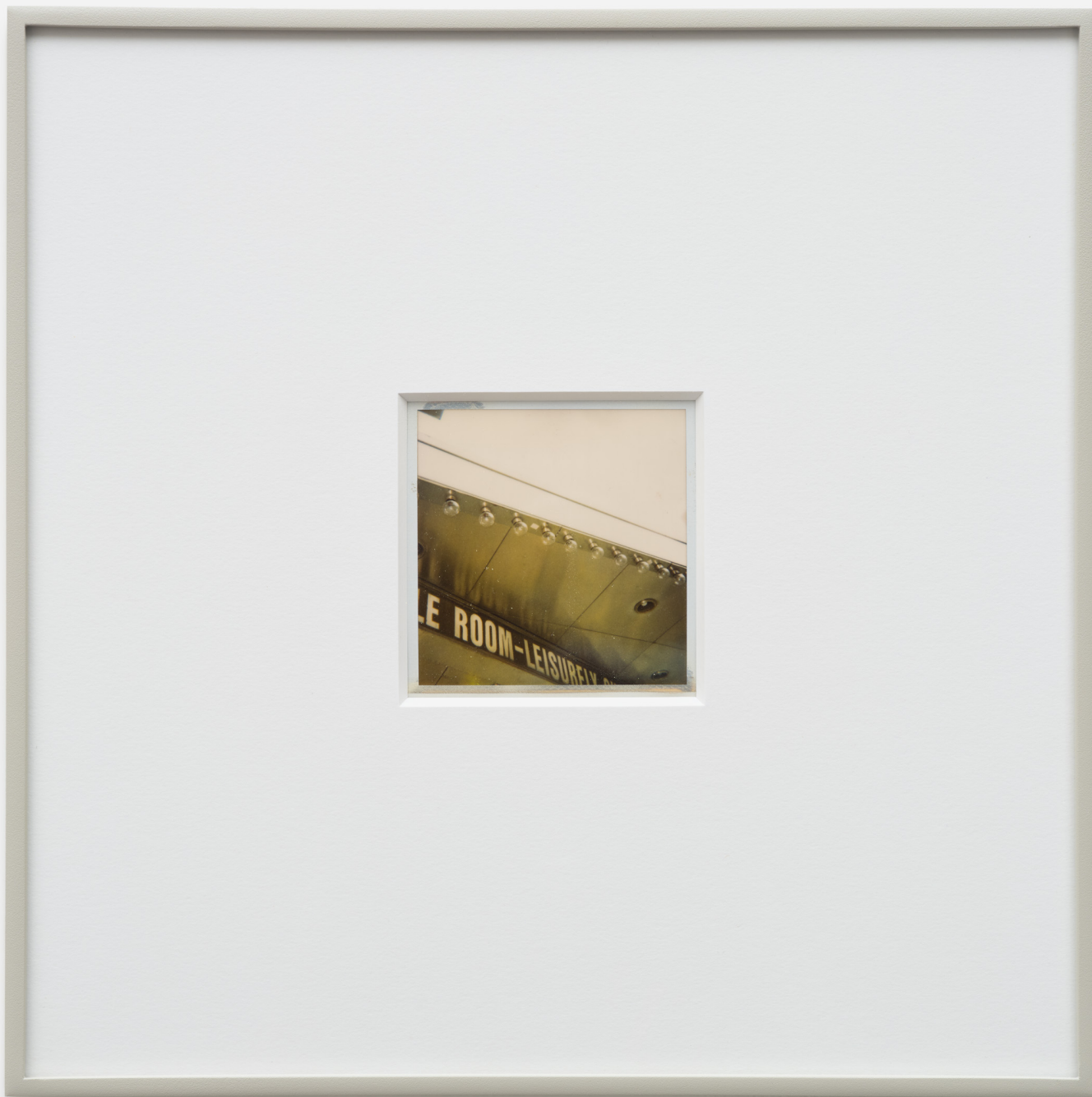
Tom Burr, Untitled (42nd Street Structures) , 1995.

Polaroid photograph. 3 1/8 x 3 1/8 in ; 8 x 8cm (image), 12 x 12 in ; 30.5 x 30.5cm (framed). 4 500$