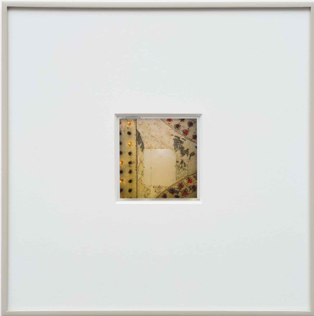
Tom Burr, Untitled (42nd Street Structures) , 1995.

Polaroid photograph. 3 1/8 x 3 1/8 in ; 8 x 8cm (image), 12 x 12 in ; 30.5 x 30.5cm (framed). 4 500$