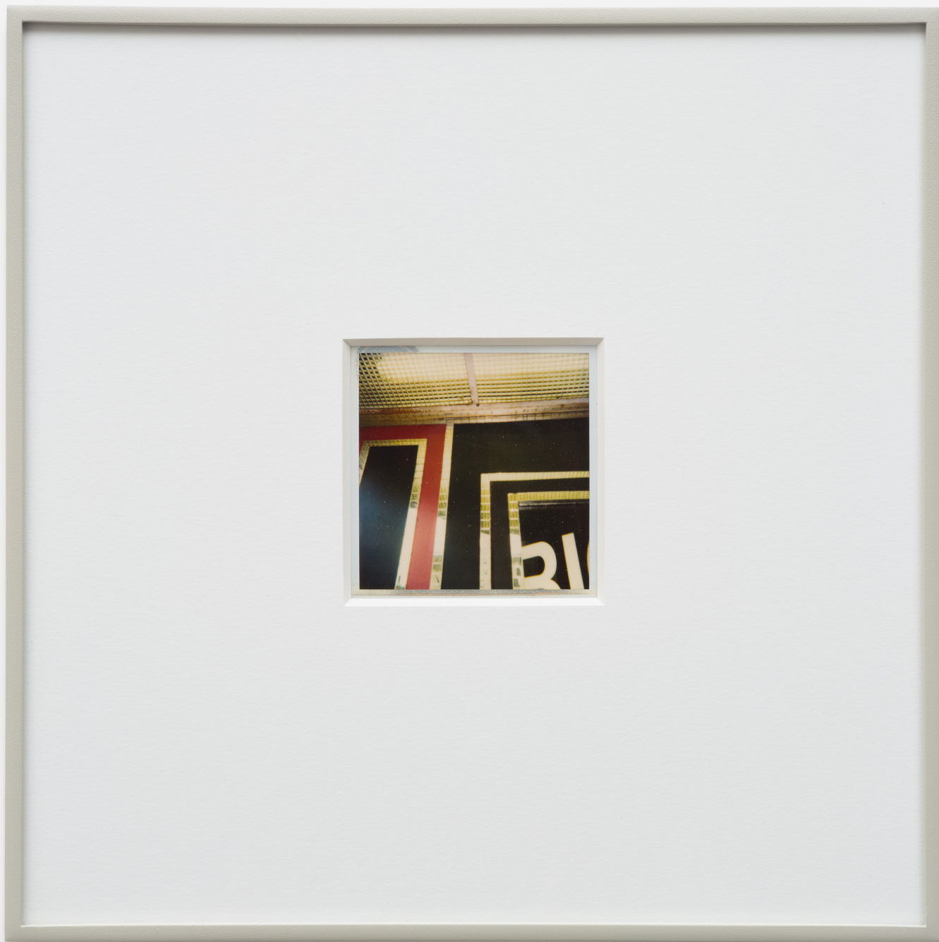
Tom Burr, Untitled (42nd Street Structures) , 1995.

Polaroid photograph. 3 1/8 x 3 1/8 in ; 8 x 8cm (image), 12 x 12 in ; 30.5 x 30.5cm (framed). 4 500$